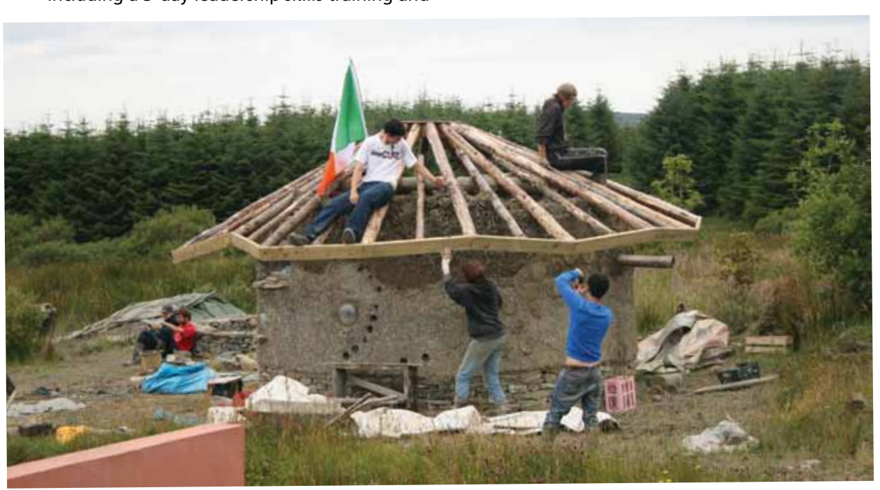
building a cob house at the youth exchange in Co. Clare