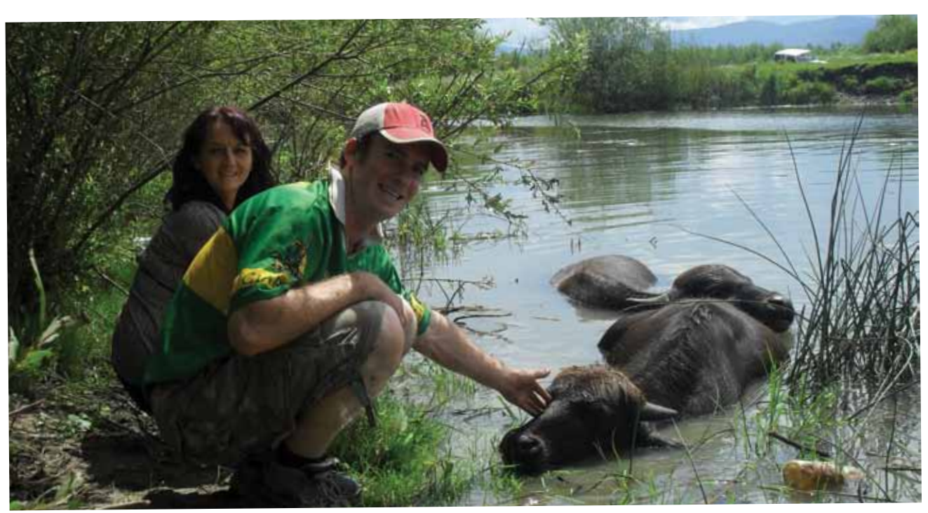
Water buffalo project in Ukraine