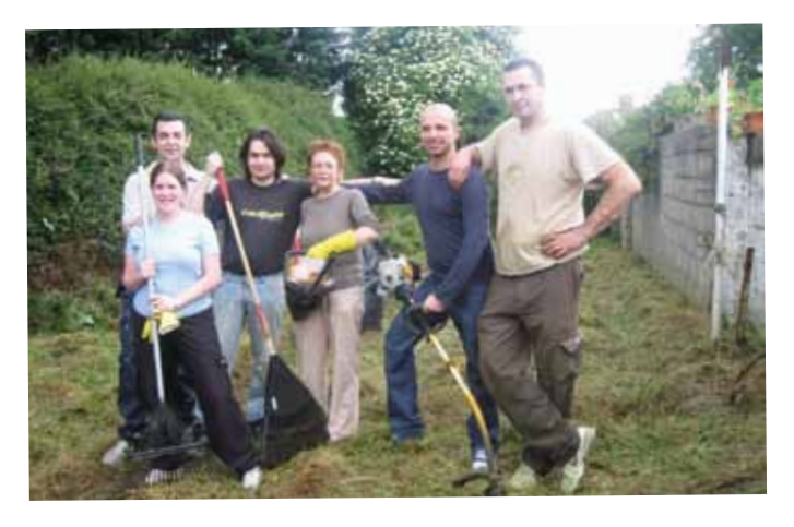
Volunteers from the Dublin Local Group in action

So far this year we have received 40 requests for assistance. We have assessed 27 and undertaken and completed 16. Since we had a good amount of active volunteers on a weekly basis and two team